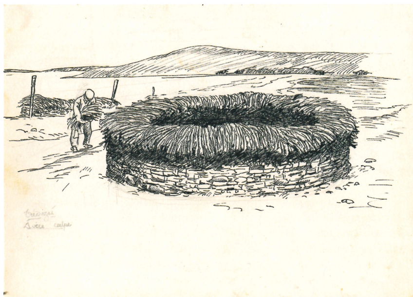
Kelp kiln, Míin Lárach, Co. Donegal, 1949