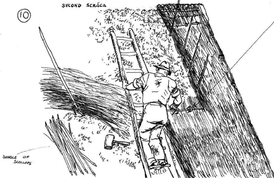
Roof construction, Carnmore district, Co. Galway, 1959